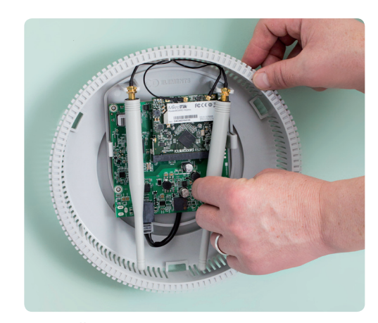
9 Install Antennas.