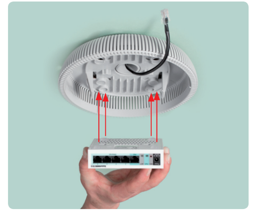
12 Attach the RB751/RB951 to the Mounting Bracket by simple Push and Lock. Device feets shall match exactly to the sockets in the Mounting Bracket.