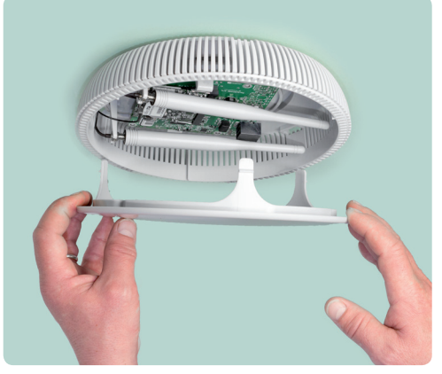
10 Close the cover. Three snap locks shall match the openings on the diameter of the Body.