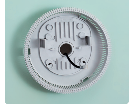
11 Attach the Mounting Bracket to the Body using bayonet lock. Don't forget to pass the cable(s).