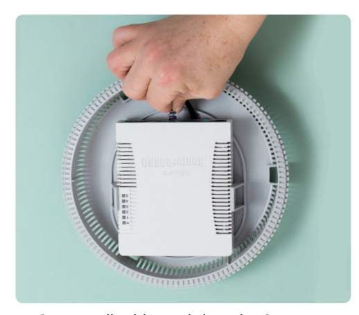
13 Connect all cables and close the Cover.